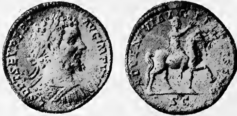
SEVERUS AND HIS SONS.

Rev. ADVENTVI. AVG. FELICISSIMO. S. C. The Emperor on horseback to r., a soldier bearing a standard leads the Emperor's horse (Sestertius struck in A. D. 167. — Coh. 8).