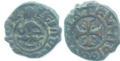
CILICIAN ARMENIA LEVON III – 1301-1307

~ These Kardez' are very distinct due to their workmanship and completeness of inscription. Most types in this series are much more crude and struck with carelessly engraved dies.