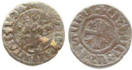
CILICIAN ARMENIA Hetoum I., 1226 - 1270.