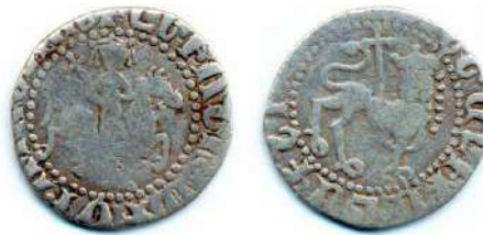
CILICIAN ARMENIA LEVON II – 1270-1289

+ՇԻՆԵԱԼ Ի ՔԱՂԱՔՆ Ի ՍԻՍ “Struck in the city of Sis”