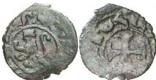
CILICIAN ARMENIA Levon V., 1374-1375.