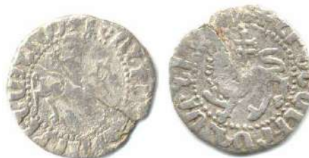
CILICIAN ARMENIA LEVON II – 1270-1289

+ՇԻՆԵԱԼ Ի ՔԱՂԱՔՆ Ի ՍԻՍ Ի “Struck in the city of Sis”