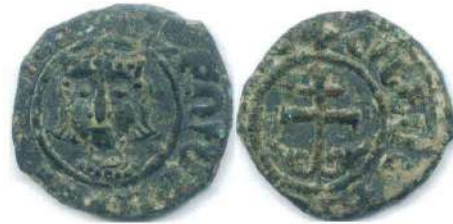
CILICIAN ARMENIA HETOUM II – 1289-1293, 1295-1296, 1299-1301, 1301-1306

...ԹՈՒՄ ԹԱԳԱՒ... "Hetoum King of Armenians"