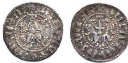
CILICIAN ARMENIA Oshin, 1307-1320.

Estimate: 100 EUR. Price realized: 400 EUR (approx. 613 U.S. Dollars as of the auction date)