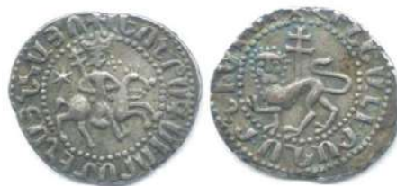
CILICIAN ARMENIA LEVON II – 1270-1289

+ՇԻՆԵԱԼ Ի ՔԱՂԱՔՆ Ի ԱԻԱ “Struck in the city of Ayas”