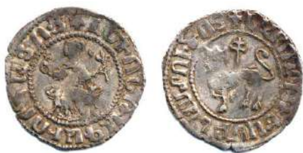
CILICIAN ARMENIA Levon I – 1199-1219

Half Double Dram. (Pre 1199 from Tarsus mint?) 22 mm.