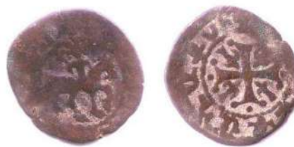
CILICIAN ARMENIA Smbat, 1269-1298.

+ ԿԱՐՈՂՈՒԹԵՆ ԱՍՏ... “By the Will of God”