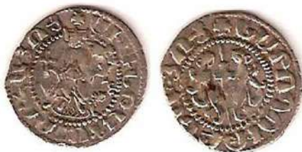
CILICIAN ARMENIA Oshin, 1307-1320.