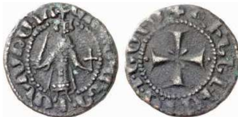
CILICIAN ARMENIA Gosdantin I – 1299