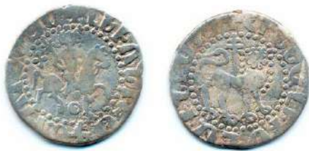
CILICIAN ARMENIA LEVON II – 1270-1289