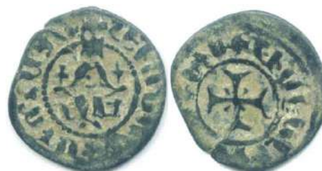
CILICIAN ARMENIA LEVON IV – 1320-1342

Estimation: € 80,00. Price realized: 64 EUR (approx. 91 U.S. Dollars as of the auction date)