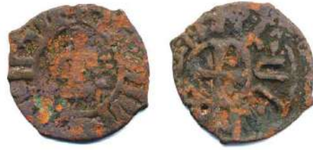
CILICIAN ARMENIA HETOUM II – 1289-1293, 1295-1296, 1299-1301, 1301-1306 AE Kardez, Sis mint. 20 mm

Estimate: 25 EUR. Price realized: 40 EUR (approx. 61 U.S. Dollars as of the auction date)