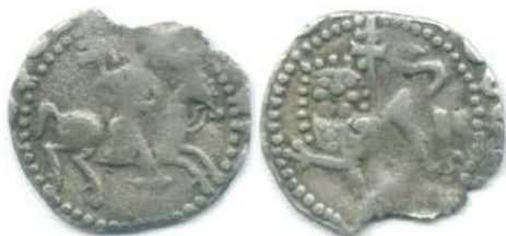
CILICIAN ARMENIA LEVON II – 1270-1289

... ՆԵԱԼ Ի ՔԱՂԱՔՆ ... “Struck in the city of Sis”