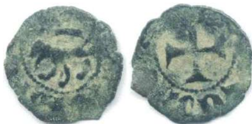
CILICIAN ARMENIA Levon V., 1374-1375.