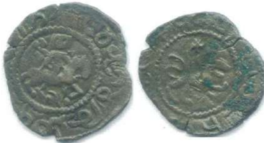
CILICIAN ARMENIA POST ROUPENIAN – AFTER 1375 ?

Notes: I recently got this poorly preserved and curious coin. At first I thought it was a copper coin of an earlier king struck with takvorin dies, but after exhaustively studying plates of coins, I could not confidently match it to any king. I suspect Oshin, but it could be a PR. Also, it is interesting to note this coin is much like the Byzantine tracheas in a "cup" shape.