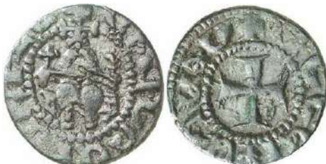
CILICIAN ARMENIA LEVON IV – 1320-1342

+ՇԻՆԵԱԼ Ի Ք[ԱՂԱՔՆ Ի] Ս “Struck in the city of Sis”