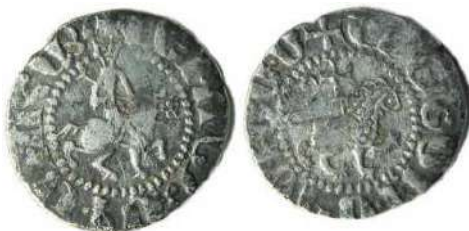
CILICIAN ARMENIA LEVON III – 1301-1307

Notes: Note the fine quality of engraving on the coin, yet a very odd, and partially illegible inscription. Perhaps made by illiterate or foreign die-makers.