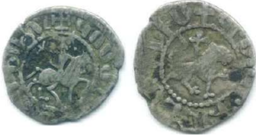
CILICIAN ARMENIA GOSDANTIN IV – 1365-1373

Constantine formed an alliance with Peter I of Cyprus, offering him the port and castle of Corycus. On Peter's death in 1369, Constantine looked for a treaty with the Sultan of Egypt. The barons were unhappy with this policy, fearing annexation by the sultan, and in 1373 Constantine was murdered. Upon his death he was succeeded by his distant cousin Leo V, who would become the last king of Cilician Armenia.