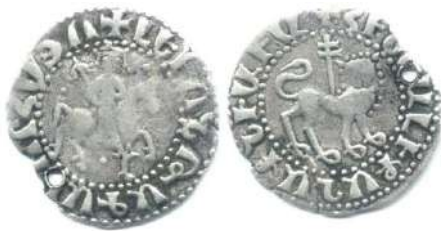
CILICIAN ARMENIA LEVON II – 1270-1289