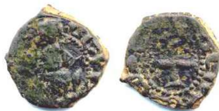
CILICIAN ARMENIA LEVON III – 1301-1307

+ՇԻՆԵԱԼ ՔԱՂԱՔՆ Ի ՄԻՍ “Struck in the city of Sis”