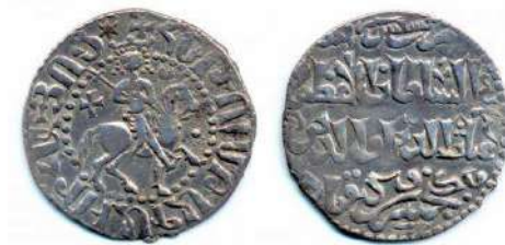
CILICIAN ARMENIA Hetoum I., 1226 - 1270.