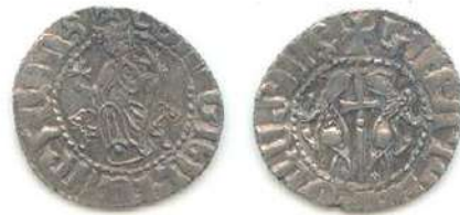
CILICIAN ARMENIA Levon I – 1199-1219

*ԿԱՐՈՂՈՒԹԵՆ ԱՍՏՈՒԾՈՅ “By the Will of God”