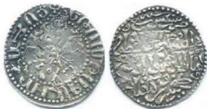
CILICIAN ARMENIA Hetoum I., 1226 - 1270.