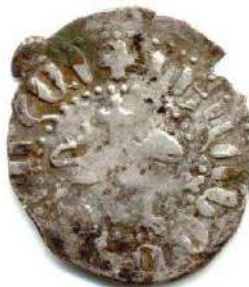
CILICIAN ARMENIA LEVON THE USURPER – 1363-1365