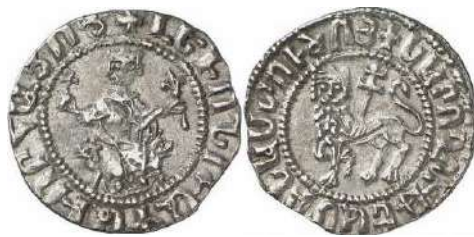
CILICIAN ARMENIA Levon I – 1199-1219

Estimation: € 100,00. Price realized: 400 EUR (approx. 570 U.S. Dollars as of the auction date)