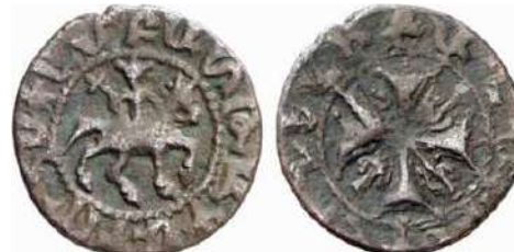
CILICIAN ARMENIA Smbat, 1269-1298.

Estimate: 25 EUR. Price realized: 40 EUR (approx. 61 U.S. Dollars as of the auction date)