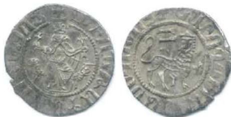
CILICIAN ARMENIA Levon I – 1199-1219

+ԿԱՐՈՂՈՒԹԵՆ ԱՍՏՈՒԾՈՅ “By the Will of God”