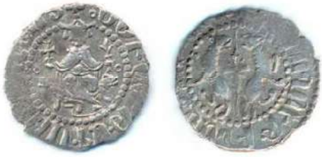
CILICIAN ARMENIA Smbat, 1269-1298.