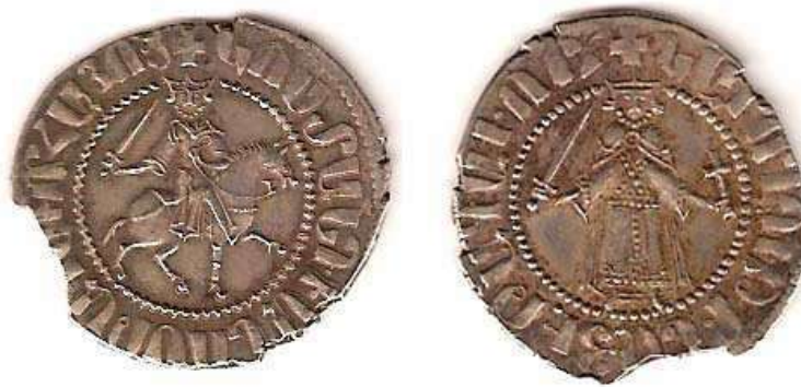
CILICIAN ARMENIA Gosdantin I – 1299

He helped his brother Sempad to usurp the throne in 1296, but turned against him two years later in 1298 to restore his older brother Hethum II. He assumed the throne for a year while Hethum recovered from his imprisonment. Shortly after Hethum's resumption in 1299, Constantine plotted to restore Sempad again, and both were imprisoned for the rest of their lives.