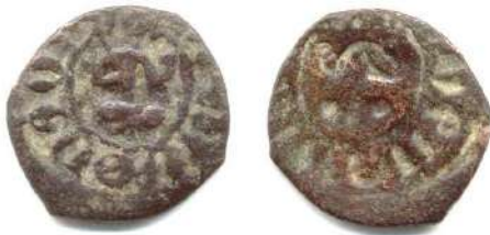
CILICIAN ARMENIA HETOUM II – 1289-1293, 1295-1296, 1299-1301, 1301-1306

+ՇԻՆԵ ... ԱՔԻ "Struck in the city of Sis"