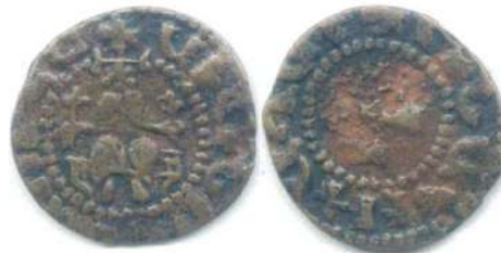
CILICIAN ARMENIA Oshin, 1307-1320.