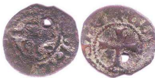
CILICIAN ARMENIA Levon V., 1374-1375.

Estimation: € 100,00. Price realized: 80 EUR (approx. 114 U. S. Dollars as of the auction date)