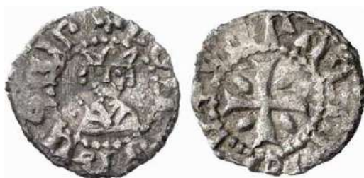
CILICIAN ARMENIA Levon V., 1374-1375.