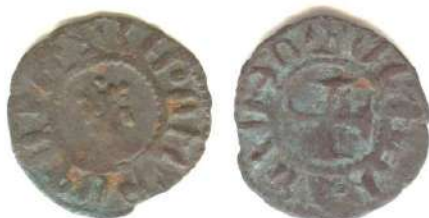
CILICIAN ARMENIA HETOUM II – 1289-1293, 1295-1296, 1299-1301, 1301-1306