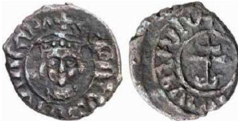
CILICIAN ARMENIA HETOUM II – 1289-1293, 1295-1296, 1299-1301, 1301-1306 Kardez. Sis mint. 4.69 g.