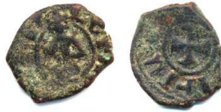
CILICIAN ARMENIA LEVON III – 1301-1307