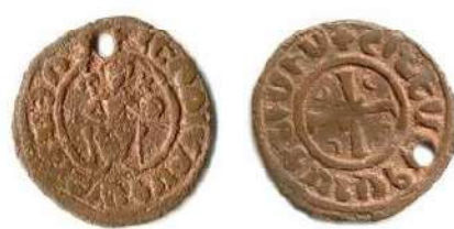
CILICIAN ARMENIA Hetoum I., 1226 - 1270.

Notes: Note the dotted border on this tank. Most tanks of Hetoum I have a solid border. Those that have a dotted border are extremely similar, a friend noted most seem to be die matches. Perhaps the work of a single engraver.