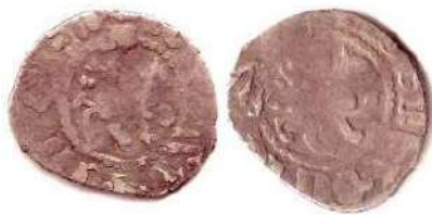
CILICIAN ARMENIA LEVON IV – 1320-1342

AR Surcharge Takvorin. Sis mint host. 17-21 mm.