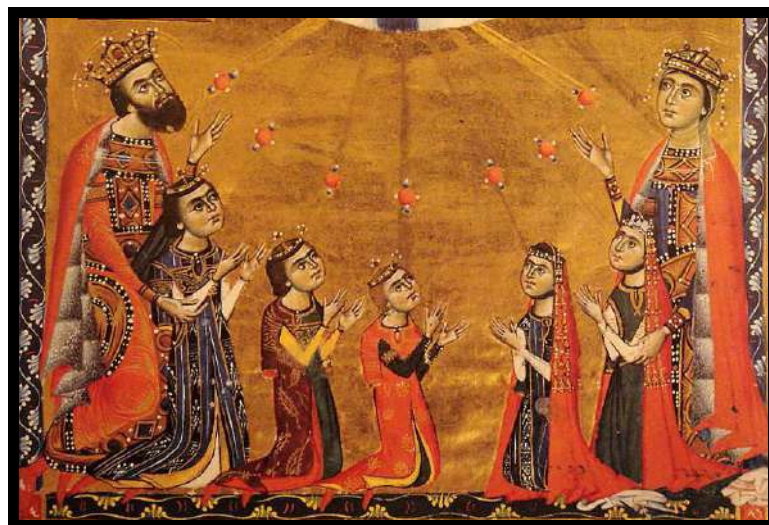
Leon II, Queen Guerane, and their five children, 1272.

Five of the fifteen children, Hetoum, Thoros, Sembat, Constantine, and Oshin, later became the Armenian kings, who often fought each other to gain the throne. Finally, it were the descendants of his daughter Isabella that would inherit the throne.