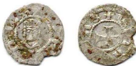
CILICIAN ARMENIA Levon V., 1374-1375.

Estimate: 50 EUR. Price realized: 360 EUR (approx. 552 U. S. Dollars as of the auction date)