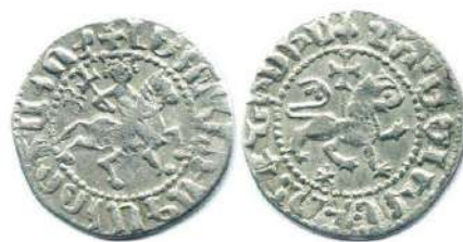
CILICIAN ARMENIA LEVON III – 1301-1307

Estimate: 30 EUR. Price realized: 80 EUR (approx. 123 U.S. Dollars as of the auction date)