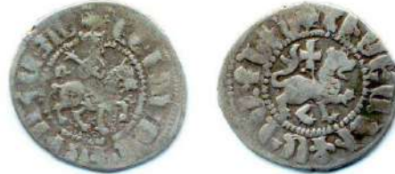
CILICIAN ARMENIA LEVON IV – 1320-1342

+ՇԻՍԱԼ Ի ՔԱՂԱՔ ՍԻՍ “Struck in the city of Sis”