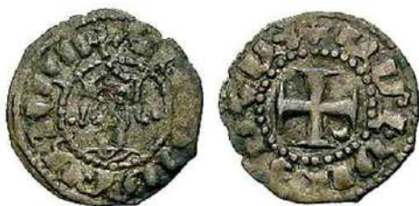
CILICIAN ARMENIA HETOUM II – 1289-1293, 1295-1296, 1299-1301, 1301-1306