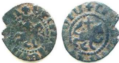
CILICIAN ARMENIA Oshin, 1307-1320.

On his death on July 20, 1320, Oshin was succeeded by his minor son Leo V. Oshin was popularly believed to be poisoned by his cousin (and brother-in-law) Oshin of Corycos.