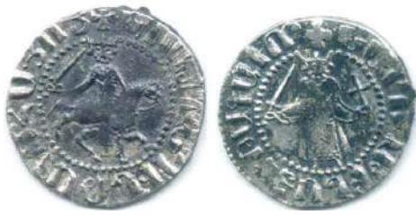
CILICIAN ARMENIA Gosdantin I – 1299