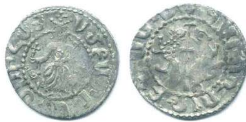
CILICIAN ARMENIA Smbat, 1269-1298.

+ ԿԱՐՈՂՈՒԹԵՆ ԱՍՏՈՒԾՈ “By the Will of God”