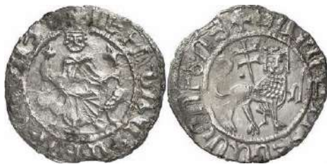
CILICIAN ARMENIA Levon I – 1199-1219

Estimation: € 100,00. Price realized: 120 EUR (approx. 171 U.S. Dollars as of the auction date)