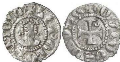
CILICIAN ARMENIA HETOUM II – 1289-1293, 1295-1296, 1299-1301, 1301-1306