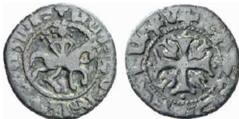
CILICIAN ARMENIA Smbat, 1269-1298.

...ՔԱՂԱՔ ՍԻ... “Struck in the city of Sis”