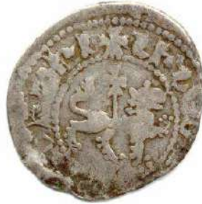
CILICIAN ARMENIA LEVON THE USURPER – 1363-1365