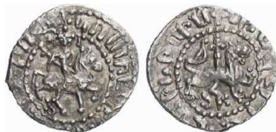
CILICIAN ARMENIA GOSDANTIN IV – 1365-1373

+ՇԻՆ ... Ի Ս “Struck in the city of Sis”