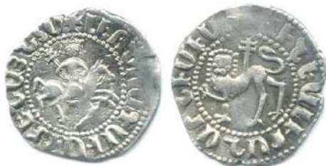
CILICIAN ARMENIA LEVON II – 1270-1289

+ՇԻՆԵԱԼ Ի ՔԱՂԱՔՆ Ի ՍԻՍ Ի “Struck in the city of Sis”