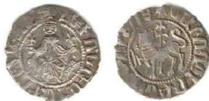
CILICIAN ARMENIA Levon I – 1199-1219

+ԿԱՐՈՂՈՒԹԵՆ ԱՍՏՈՒԾՈՅ “By the Will of God”