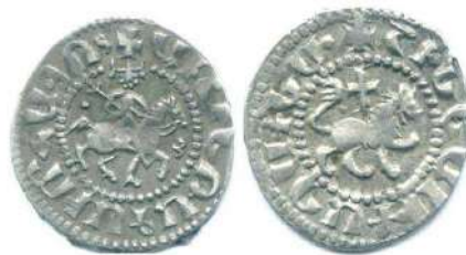
CILICIAN ARMENIA Oshin, 1307-1320.

*Note the error in the spelling of the kings name. It reads: ՕՏԻՆ, but it should read ՕՏԻՆ. Missing the letter Ն in the end.