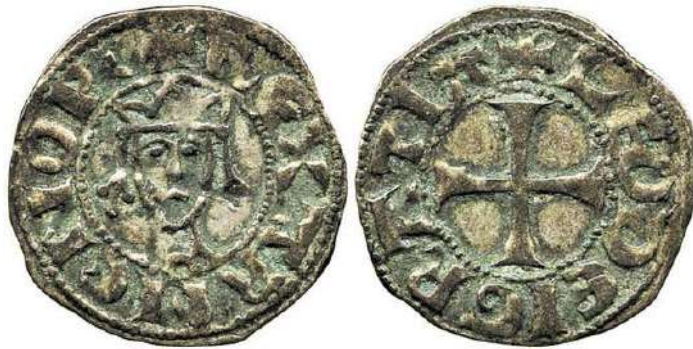
CILICIAN ARMENIA Levon I – 1199-1219

Estimate: 40 EUR. Price realized: 80 EUR (approx. 123 U.S. Dollars as of the auction date)