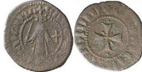
CILICIAN ARMENIA Gosdantin I – 1299

Estimate: 100 EUR. Price realized: 420 EUR (approx. 644 U.S. Dollars as of the auction date)