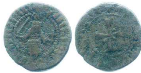
CILICIAN ARMENIA Gosdantin I – 1299

+ԿԱՐՈ ... ԹԲՆ ԱՅ Ե ԹԱԳԱԻՈՐ “By the Will of God is he King”