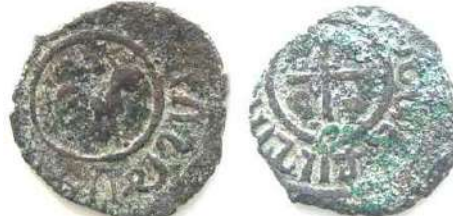
CILICIAN ARMENIA LEVON II – 1270-1289

Reverse: Lion standing to the left, patriarchal cross with two bars behind.