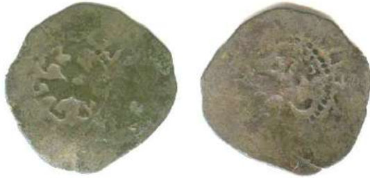
CILICIAN ARMENIA POST ROUPENIAN – AFTER 1375 ?