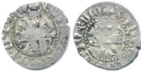
CILICIAN ARMENIA LEVON IV – 1320-1342