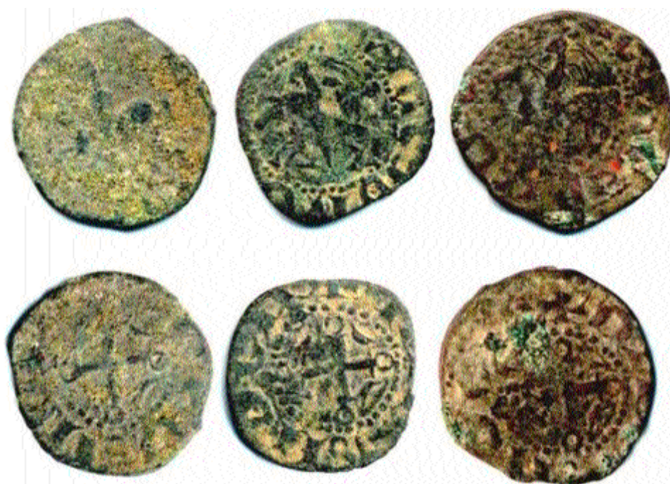
Baronial coppers of Levon II. 1187-1199

Leo was a powerful ruler, remembered by chroniclers as "Leo the Magnificent". His court at Sis was cultured and he was a supporter of calligraphy and the arts. He allied himself with the Knights Hospitaller and the Teutonic Knights, but drove the Knights Templar from his kingdom. He fostered commerce with Venice and Genoa, opening his ports at Ayas and Corycos to the world. The Assizes of Antioch were adopted as the law of the kingdom,