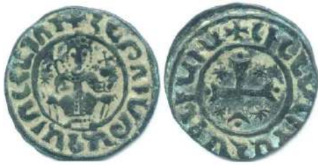
CILICIAN ARMENIA Hetoum I., 1226 - 1270.