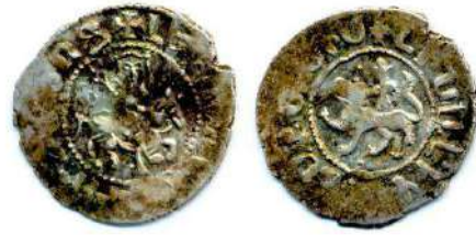
CILICIAN ARMENIA LEVON IV – 1320-1342

+ՇԻՍԵԱԼ Ի ՔԱՂԱՔ ՍԻՍ “Struck in the city of Sis”