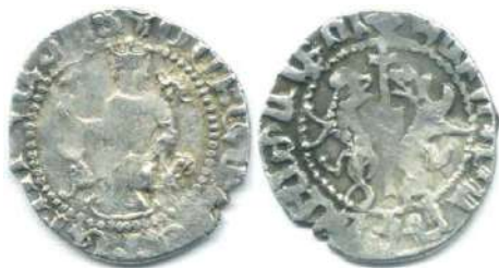
CILICIAN ARMENIA Smbat, 1269-1298.