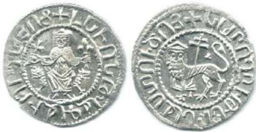
CILICIAN ARMENIA Levon I – 1199-1219

Double Dram. (Pre 1199 from Tarsus mint?) 28mm, 5.49g.