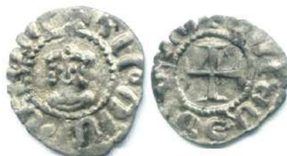
CILICIAN ARMENIA HETOUM II – 1289-1293, 1295-1296, 1299-1301, 1301-1306