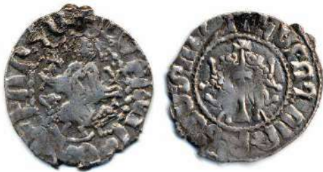
CILICIAN ARMENIA Smbat, 1269-1298.

Notes: There are circles in the field, and between the cross and first letter in the legend. This is a curious and unknown phenomenon seen on some of Smbat's drams. Only these two have them in the legend as well, most only between the king next to throne's lions. This specimen appears to be a die match to CNG 61, Lot: 2350.