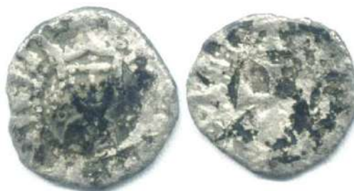
CILICIAN ARMENIA Levon V., 1374-1375.

AE "Billon." 15 mm, 1.00 gm. Wrong metal, unique.