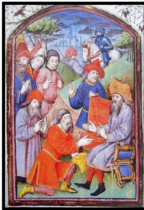
Hetoum I (seated) in the Mongol court of Karakorum, "receiving the homage of the Mongols".[1] Miniature from "Histoire des Tartars", Hayton of Corycus, 1307.

Hetoum abdicated in 1270 in favor of his son Leo II, and lived out the rest of his life in a monastery, as a Franciscan monk.