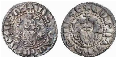
CILICIAN ARMENIA Oshin, 1307-1320.