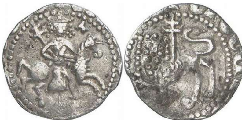
CILICIAN ARMENIA LEVON III – 1301-1307

In August, 1307, Leo and Hethum were murdered with their retinue while visiting the Mongol emir Bilarghu at Anazarva. He was succeeded as king by his uncle, Oshin.